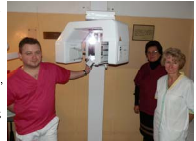
Panorex X-Ray Unit in Riga