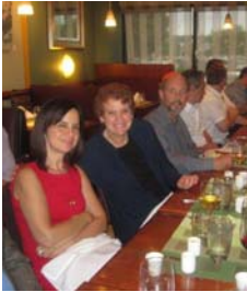
board members at work

The mid-year Foundation meeting scheduled concurrently with the meeting of the Fraternity Board, gave a positive look into the future of our meetings. The locale, the hotel, conference availabilities, and the attraction of our Nation's Capital, augers well for future meetings. Following is a resume of reports, reflecting on future plans: