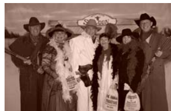
Jessie James Hole-in-the-Wall Gang Richmans, Rothmans, Specktors