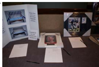
Silent Auction Items