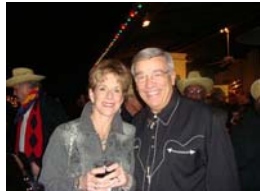
The Western Tourials

As conventions go, this past year's venue was smaller than it has been in the past. Nonetheless the warmth and camaraderie at the venue in Scottsdale, the Westin Kierlands Hotel and Resort, matched the climate of Arizona.