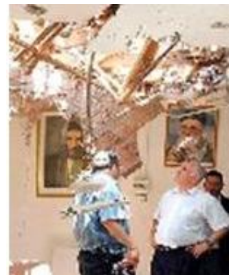
Destruction in Sderot