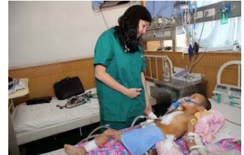
"Save a Child's Heart" Patient

Appearing on this page is a resume of projects and programs that are recipients of grant awards. Chapters are encouraged to adopt at least one as an annual charitable endeavor. "Try it...you'll like it!"