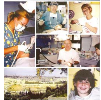
"Dental Volunteers in Israel" Trudi Birger Clinic, Jerusalem