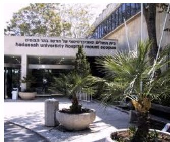
Hadassah Hospital opposite HUSDM

The Alpha Omega Foundation, US, has approved an emergency grant to Hadassah, and we are