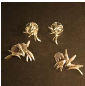
Pins & Cuff Links