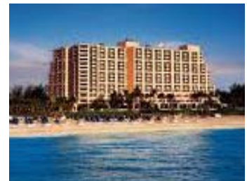
Harbor Beach Marriott